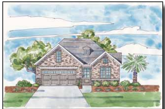
Alternate Elevation w/o Golf Cart